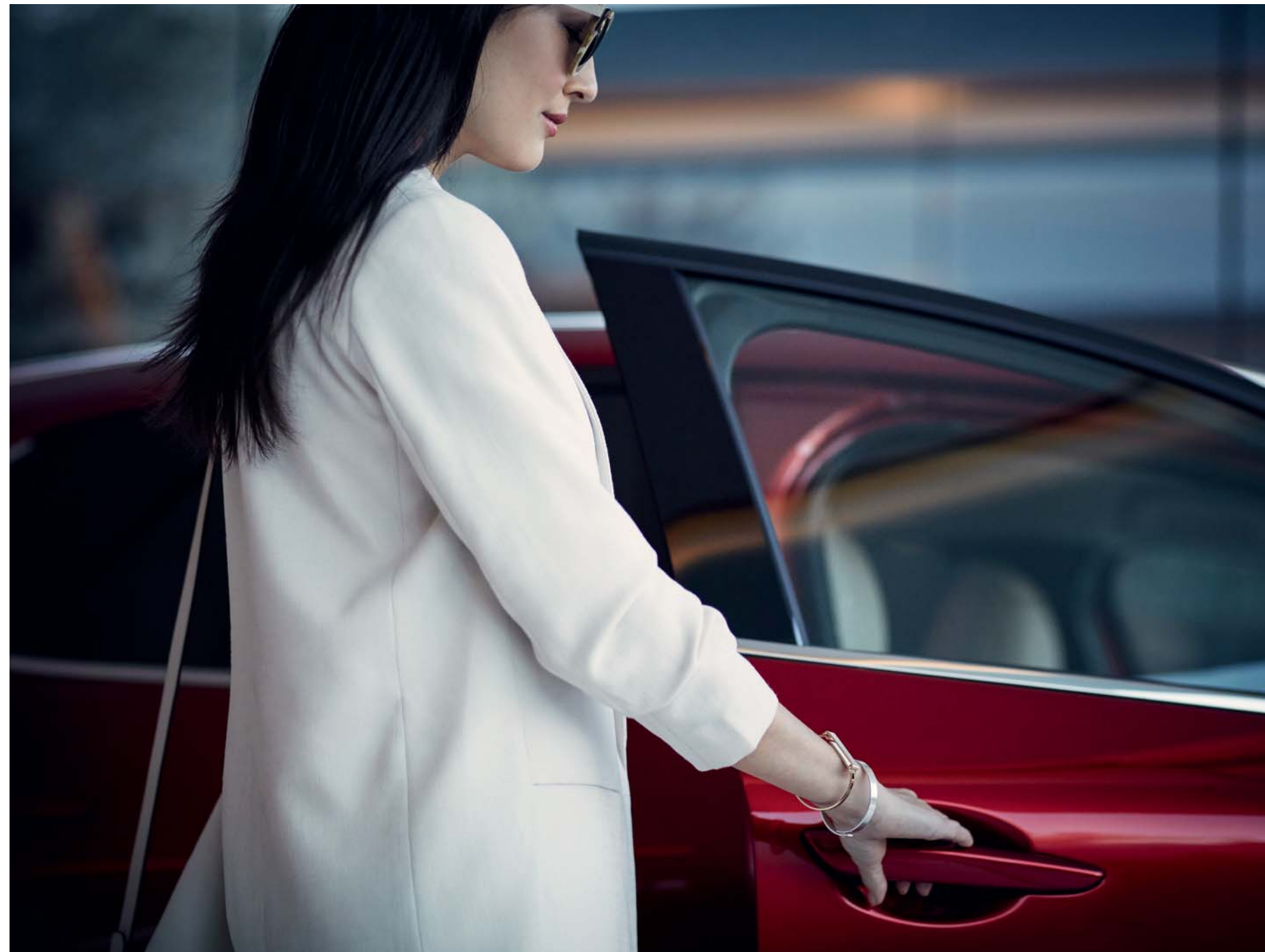
Both images are showing a Mazda CX-30 GT Sport in optional Soul Red Crystal