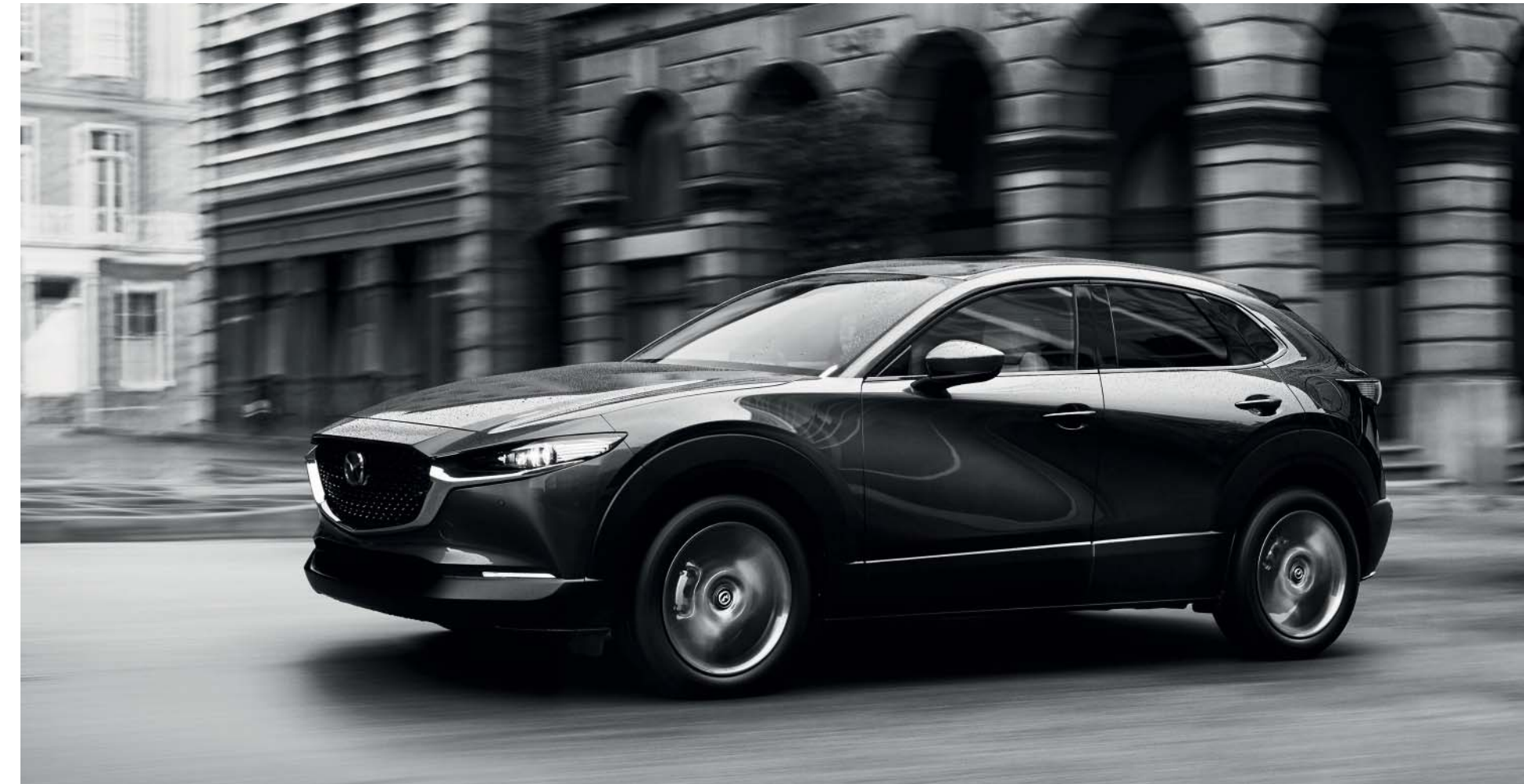
Images are showing a Mazda CX-30 GT Sport in optional Soul Red Crystal