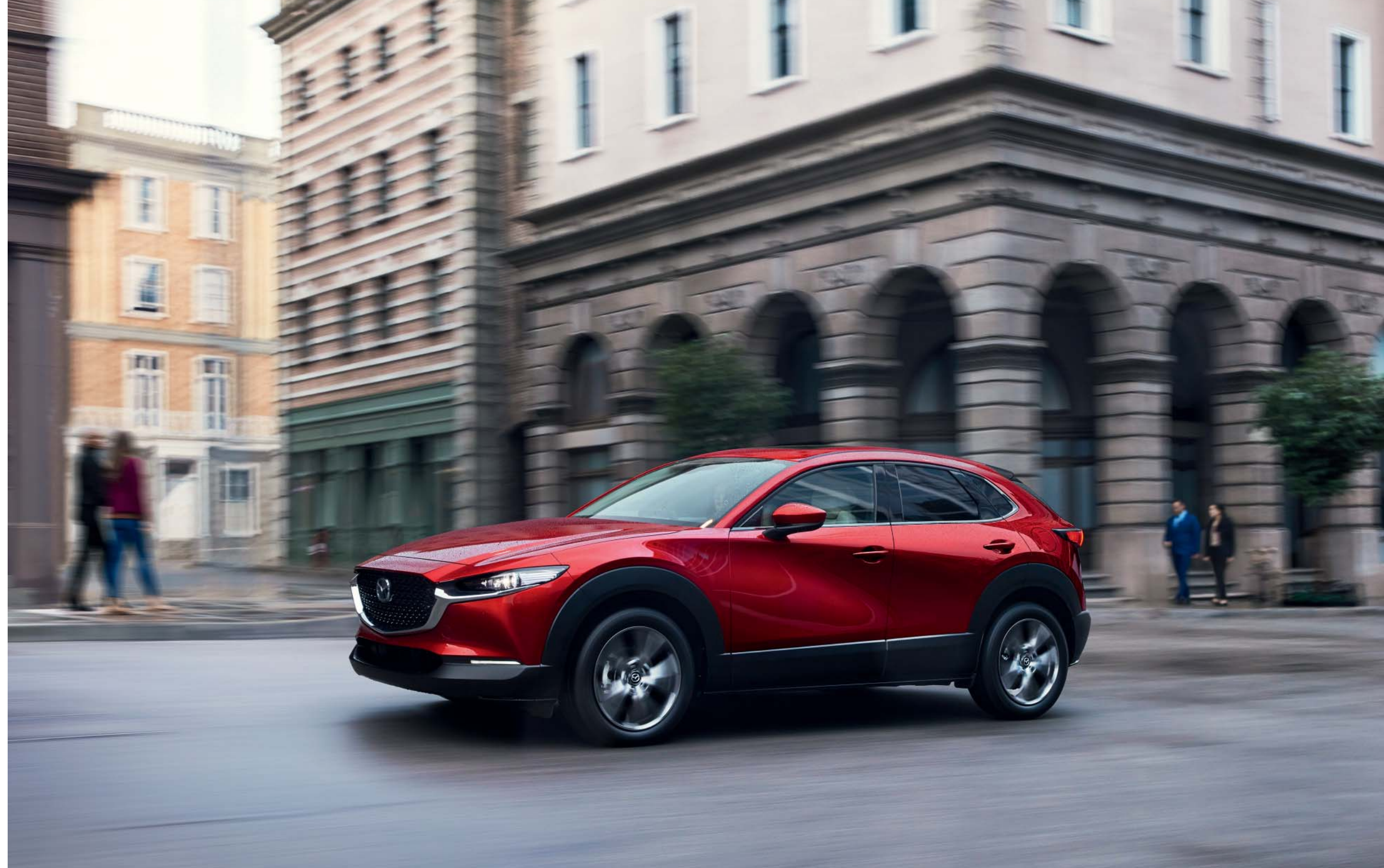
This image is showing a Mazda CX-30 in optional Soul Red Crystal