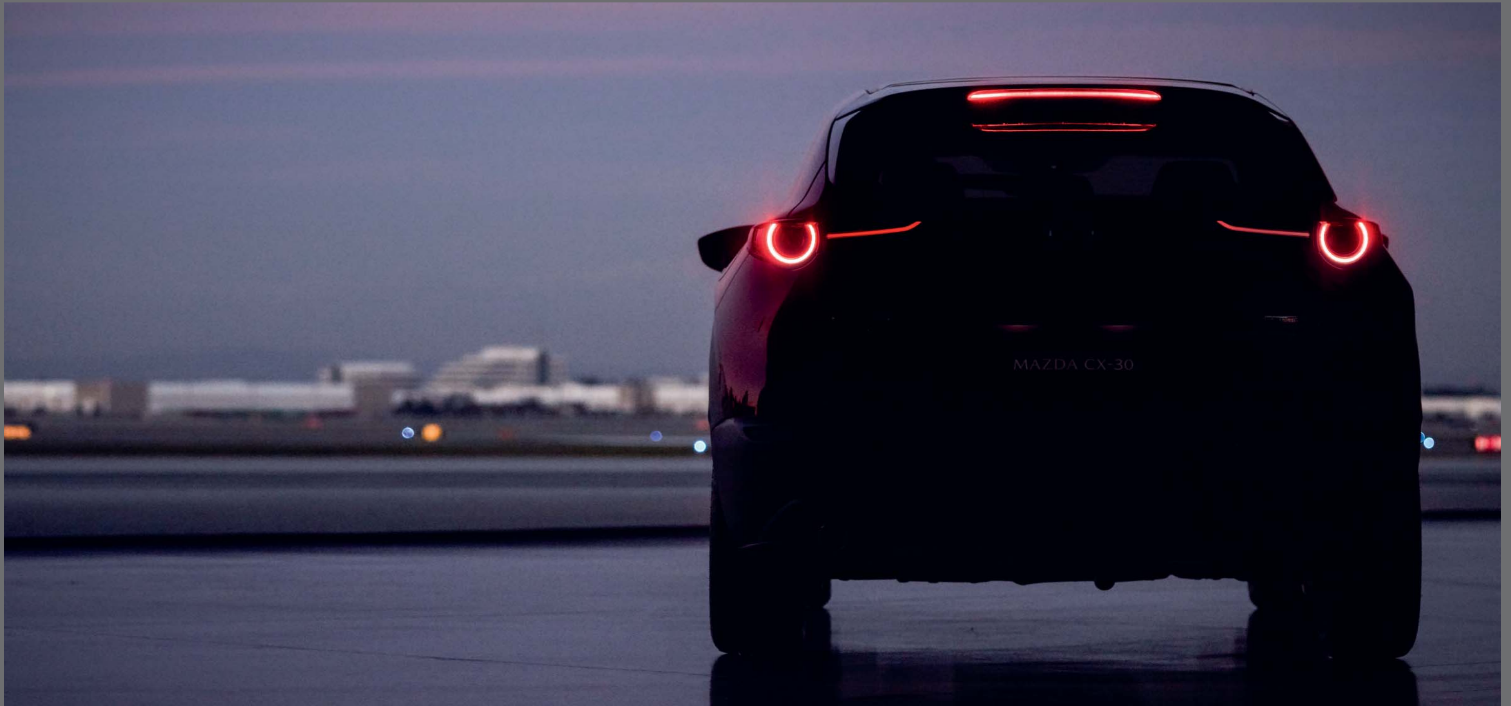
This image is showing a Mazda CX-30 GT Sport in optional Soul Red Crystal