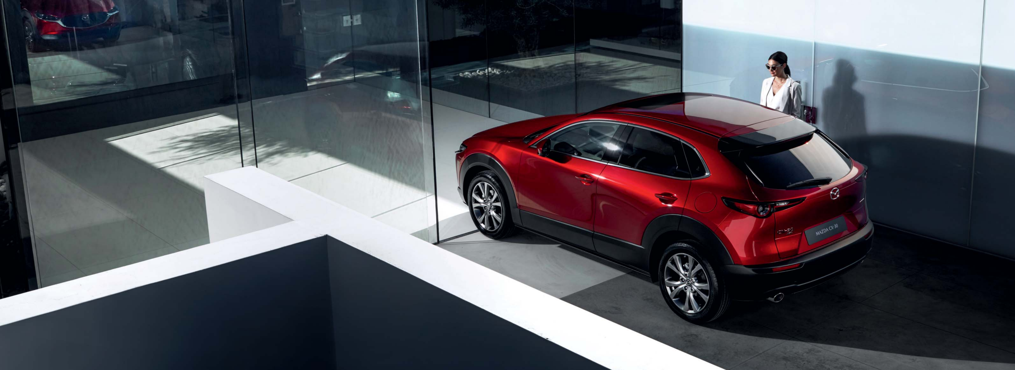
This image is showing a Mazda CX-30 GT Sport in optional Soul Red Crystal