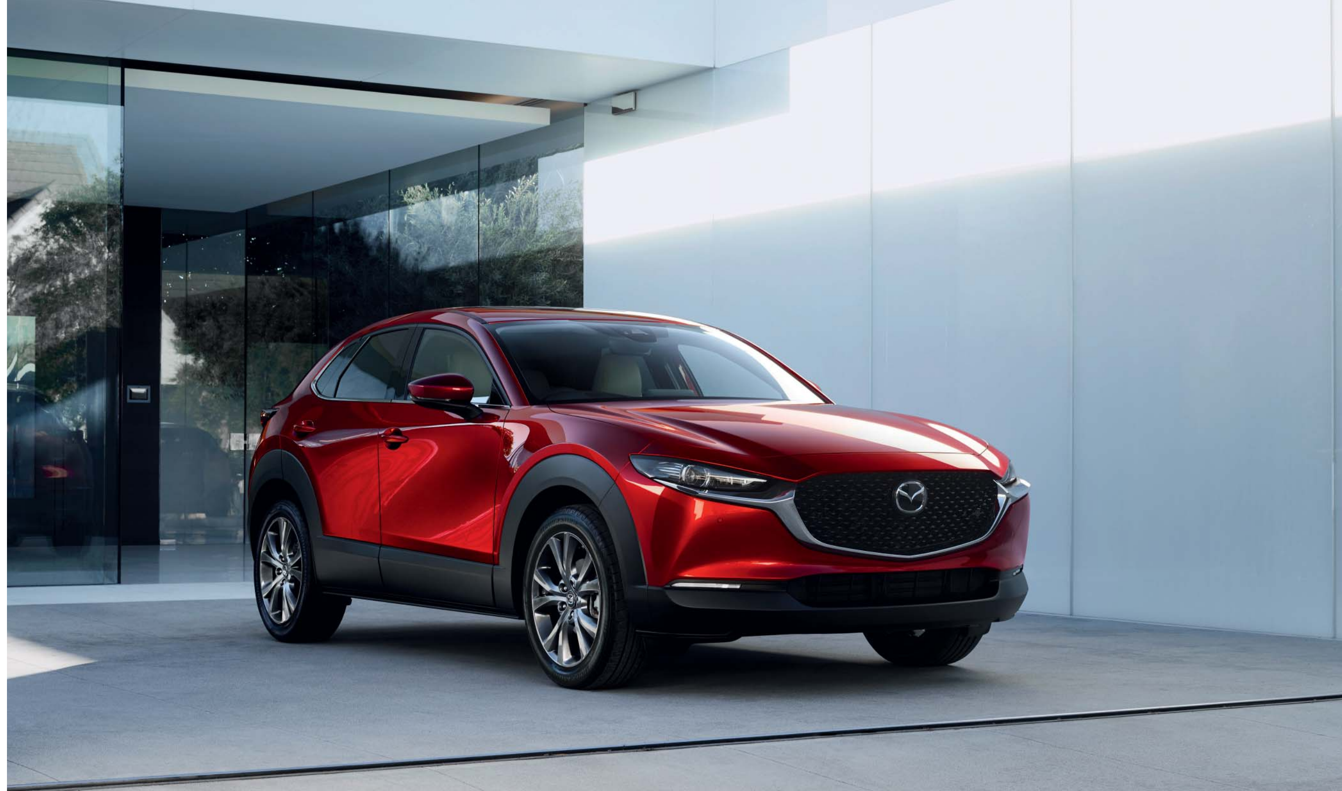
Both images are showing a Mazda CX-30 GT Sport in optional Soul Red Crystal