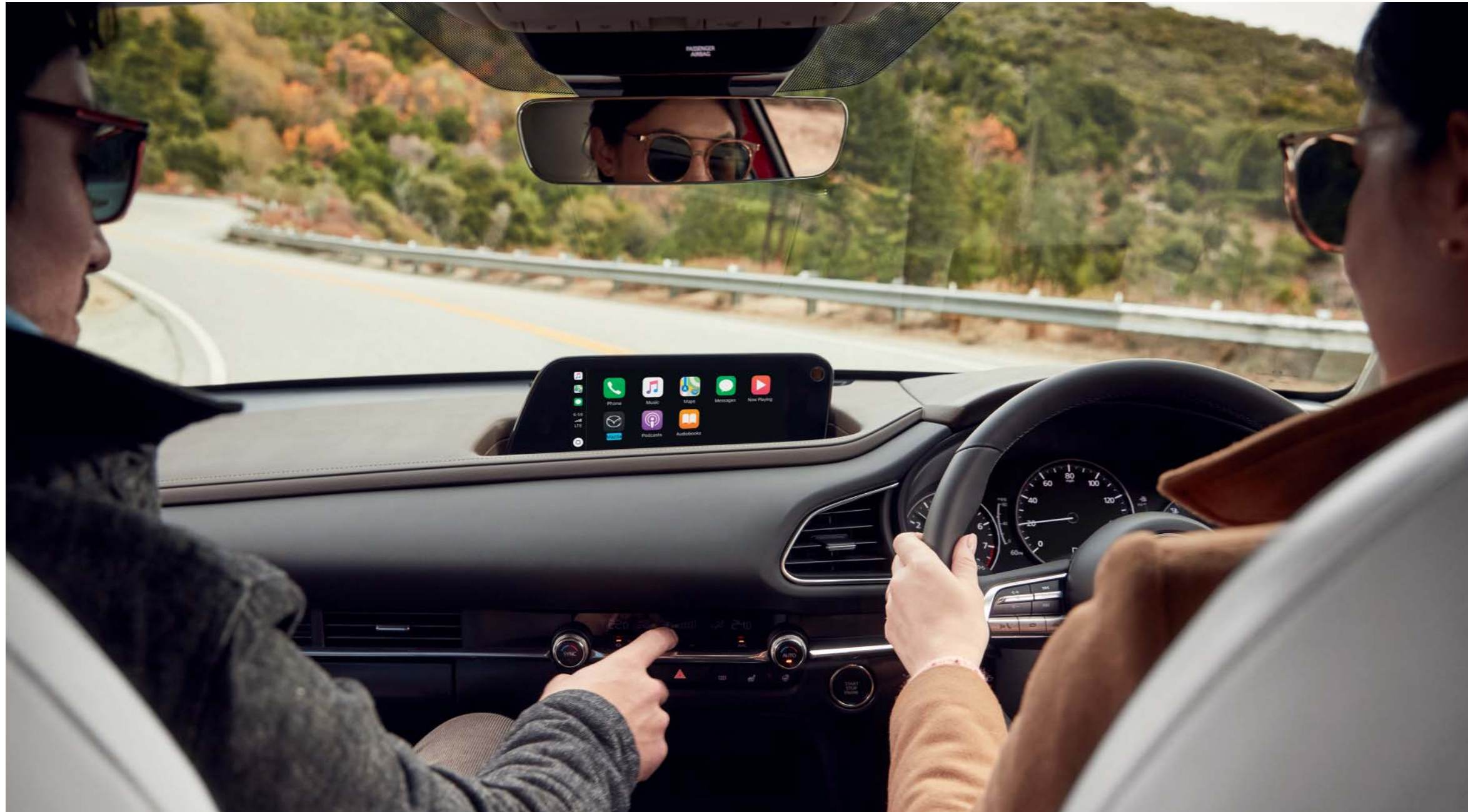
This image is showing a Mazda CX-30 GT Sport in optional Soul Red Crystal