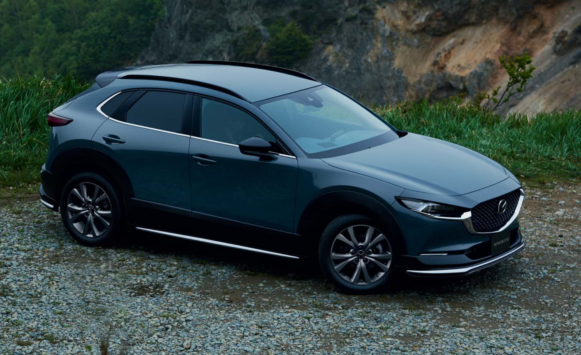
Aero Parts and Roof Rails

DESIGNED TO COMPLEMENT YOUR MAZDA CX-30. AND YOU.