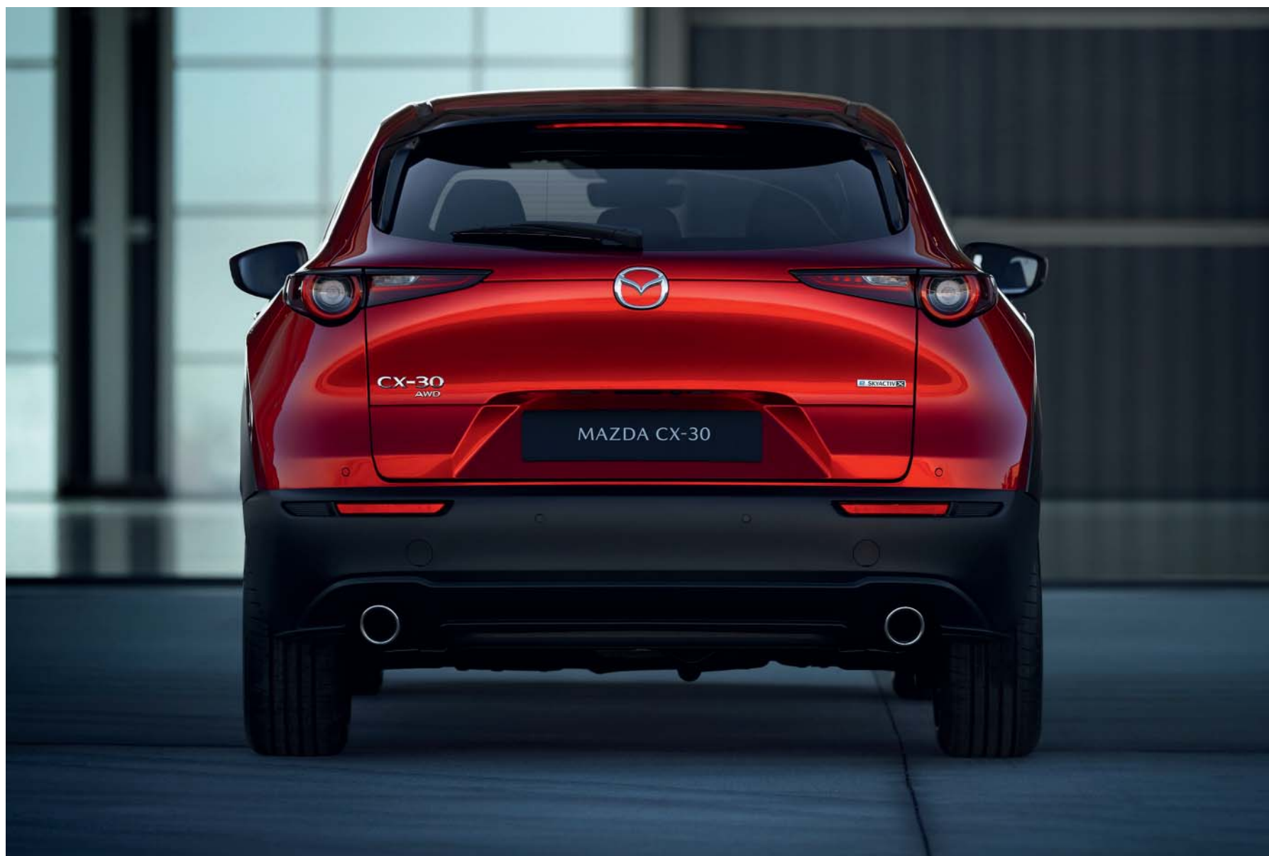
This image is showing a Mazda CX-30 GT Sport in optional Soul Red Crystal