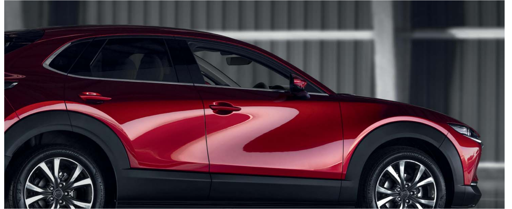
This image is showing a Mazda CX-30 GT Sport in optional Soul Red Crystal