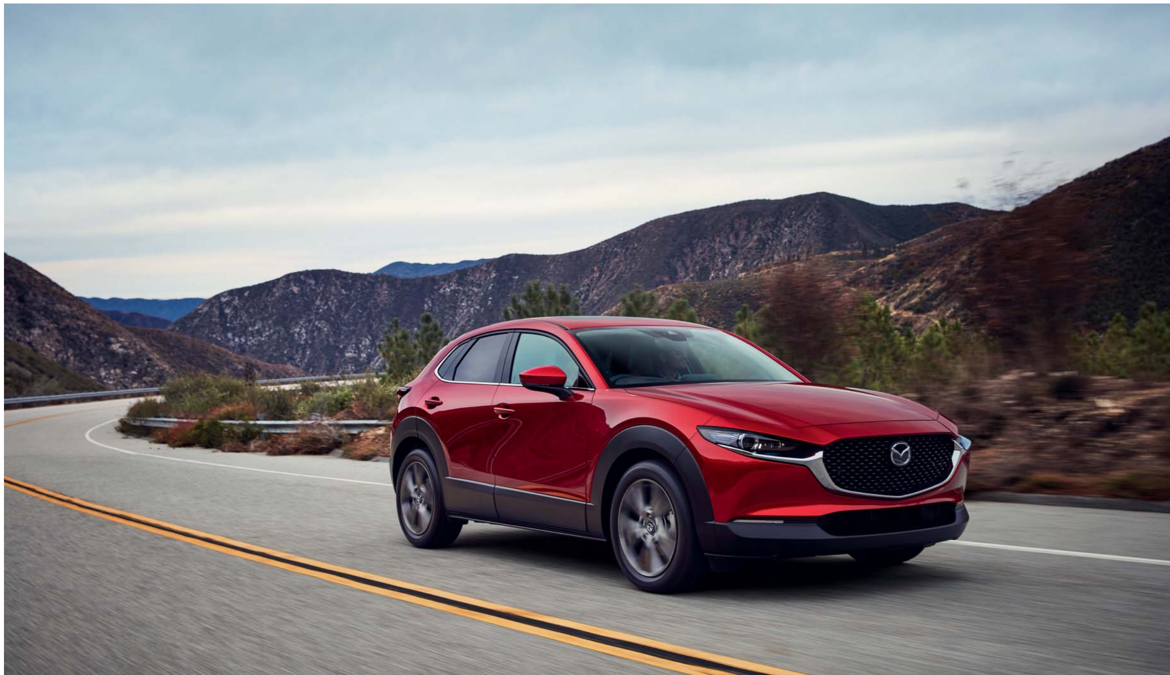
This image is showing a Mazda CX-30 GT Sport in optional Soul Red Crystal

We've never been satisfied with the status quo. We refuse to do things the way they have been done for years. Which is why our available all-wheel-drive system is created to perform like no other. Breakthrough technology that predicts the unexpected. This is i-Activ AWD. Inventive engineering that helps detect the possible loss of traction by actively monitoring everything from outside temperature and windshield wiper usage to the driver's steering and braking inputs. Together with Skyactiv-Vehicle Dynamics with G-Vectoring Control Plus, the system helps maintain road grip and steering accuracy by shifting vehicle weight upon turn entry and exit to achieve a smoother, more responsive drive. Innovative solutions that give way for more confident driving, no matter the conditions.